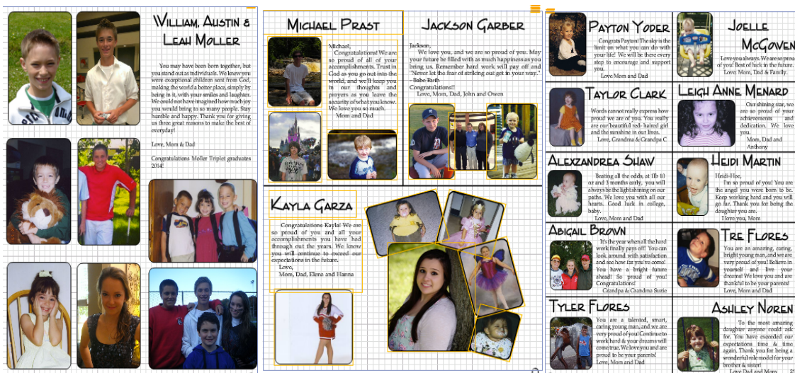
Full Page Example

NOTE: These are low-resolution samples—actual print quality is much higher.